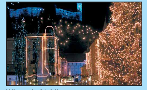
Winter in Ljubljana