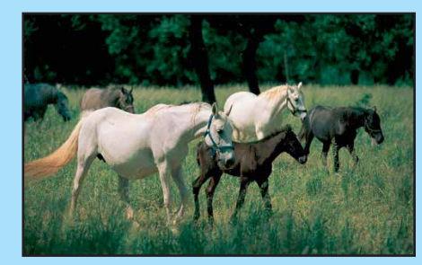
Lippazaner horses in Lipica, Karst