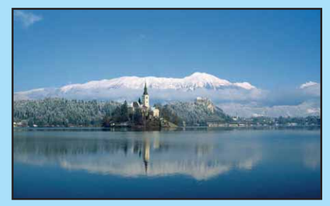
Winter in Bled