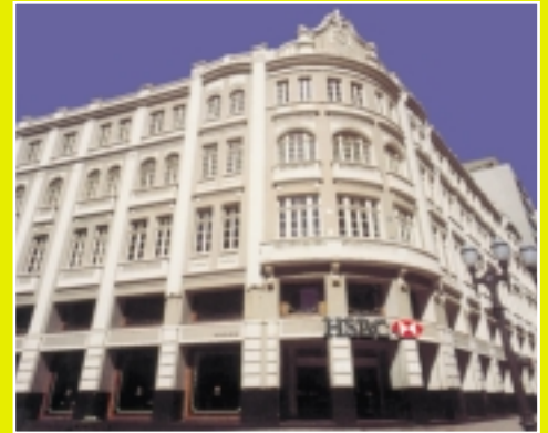
HSBC Bank Brazil's headquarters building in Curitiba, Brazil

Figures of the Central Bank show that the major retail banks are still Brazilian institutions: Banco do Brasil and Caixa Econômica Federal, from the public sector; and Bradesco and Itau, from the private sector. Nevertheless, the opening up of the sector has progressed in the past few years, thanks to privatisation and liquidation of many institutions. Among the 50 top banks in Brazil, about half of them have either foreign origins or at least a foreign associated partner. Examples of British and European presence in this sector are ABN, AMRO, Santander, HSBC, Creditanstalt, BBVA, Lloyds, Deutsche, ING, Barclays and Dresdner. A few of them, such as ABN, HSBC and Santander, have already consolidated an important presence in retail banking