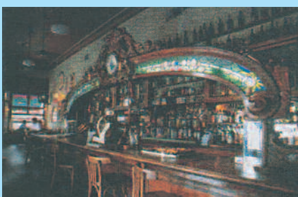
Bar in Monserrat