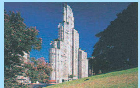
The Kavanagh, Retiro