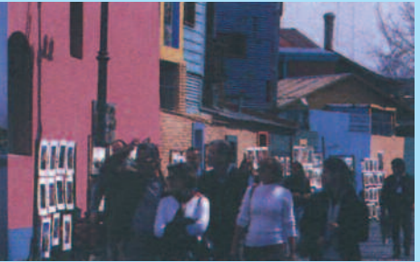
Caminito, La Boca

B uenos Aires, on the banks of the Rio de la Plata is a global, open hearted metropolis, a place where tango, literature, good food, shopping, music, films, theatre, football and nightlife converge. A concoction of European-style appeal and Latin feeling, the Queen of the Rio de la Plata has everything to offer the tourist. You can learn how to tango, which, developed by immigrants over a century ago, is the purest expression of the melancholy felt by these people as they lived in the shadows of the ships that had brought them from Europe. You can also enjoy the amazing culture on offer in its museums, excellent theatres, public parks, exhibition centres and historical neighbourhoods. Like most capital cities the shopping experience is a must, booming local fashions and designs mingle with antiques or avant-garde objects, period and fashionable furniture, handicrafts and works by creative young artists. Though meat-based dishes are the soul of Argentine cuisine, many others are influenced by Spanish, Italian, Jewish, Oriental and other ethnics groups. Buenos Aires, a Latin city after all, where the pleasure of enjoying a good meal or musical show can be as unforgettable as attending a football match, a sport so close to Argentine hearts that could be considered one of the fine arts.