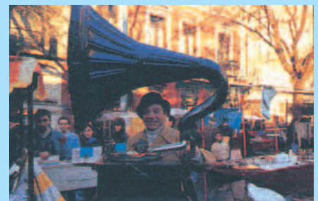
San Telmo Fair