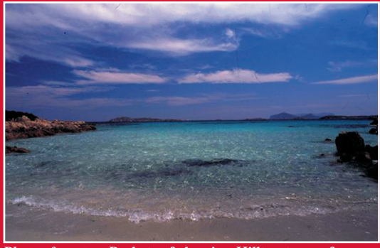
Photos from top: Baskets of cherries; Hilltop town of Sangimignano; Catherdral and Bell Tower of Florence Catherdral; Costa Smeralda. Below: Vicenza Theatre