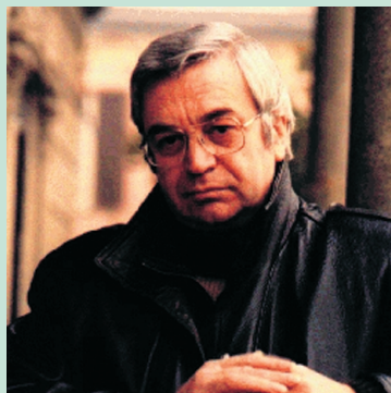
Angelo Gilardino (b.1941)