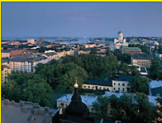
Helsinki was founded in 1550 and became the nation's capital in 1812