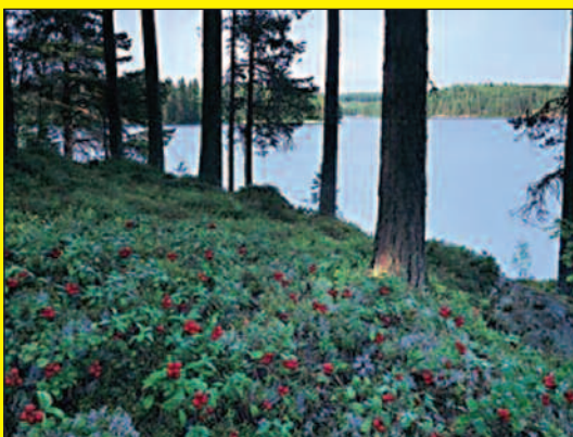
Lingonberries in a Finnish forest