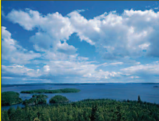
Limpid Lake Päijänne is Finland's deepest inland body of water

Finland is an advanced industrial economy