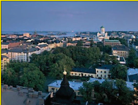
Helsinki was founded in 1550 and became the nation's capital in 1812