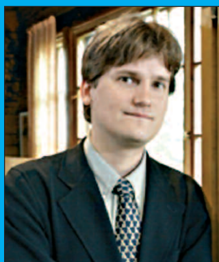
Olli Mustonen (b.1963)