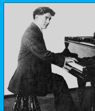
Manuel M. Ponce (1882-1948)

the role of the kantele is taken by the guitar in sorrow and in happiness. The journey starts in the runo singer's lowly cottage and eventually returns to its origin but not before taking the listener to many strange realms, even the domains of death..."