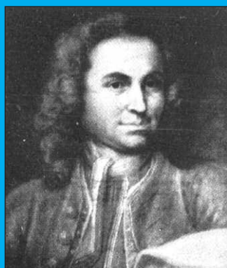
J. S. Bach (1685-1750)