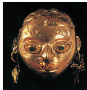
Mask from La Tolita culture

Main Pic: The high altar of the church of "La Campania" coated in gold leaf. Inset pics: Left: The domes of Cuenca's Cathedral. Right: Ingrapirca, the Temple of the Sun.