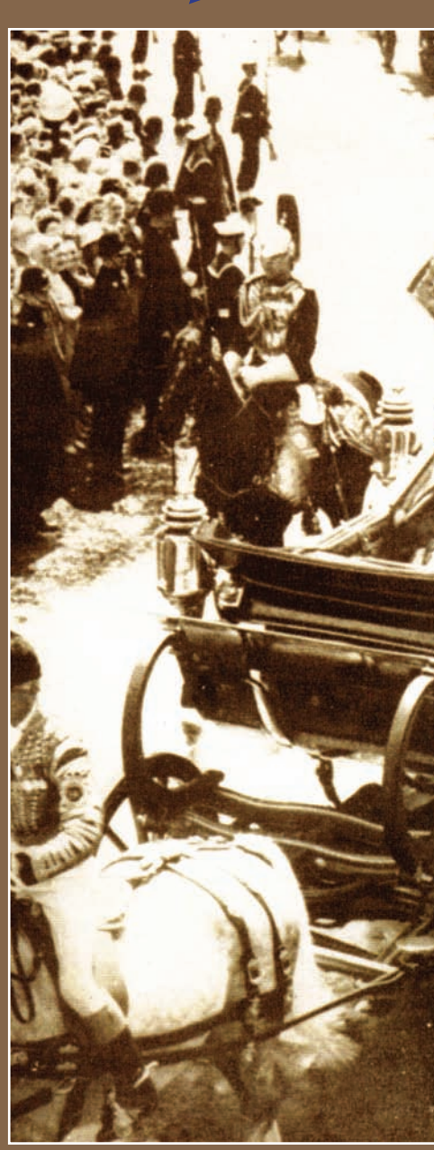
The crowd gathered to