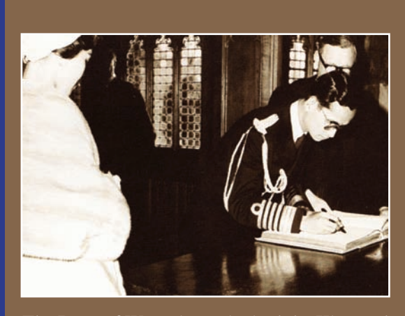
The Dean of Westminster invited the King and Queen of Thailand to sign the Visitors' Book