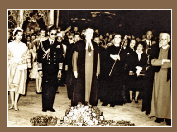
The King and Queen arrived at Westminster Abbey