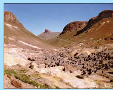
Potosí - Ghost town of Portugalete