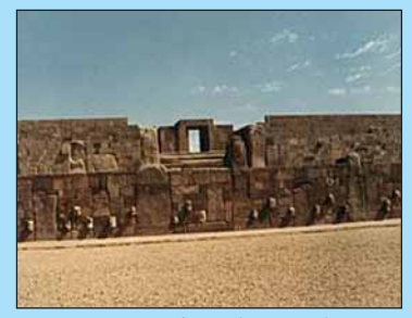
La Paz - Tiwanaku Temple