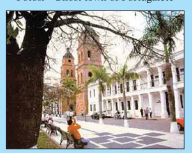
Santa Cruz de la Sierra Plaza 24 de Septiembre