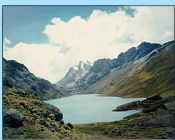
La Paz - La Cordillera (The Andes)